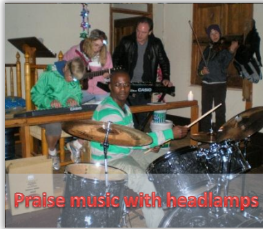
Praise music with headlamps