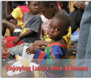
Enjoying Lulu's Rice & Beans