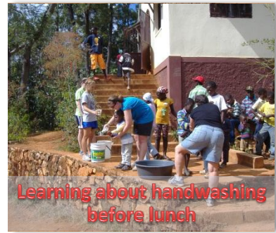
Learning about handwashing before lunch