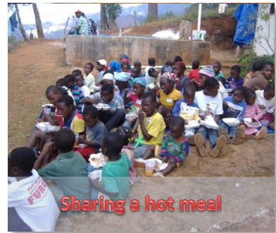
Sharing a hot meal

In leaving Haiti, the group felt that it was not an ending, but merely a beginning. There is still so much to be done and thankfully, the opportunities to help are endless! One opportunity to do so will occur on Sunday May 6 th at 2 pm at the Westport UMC, where the Union Brothers Singers (a group of Haitian brothers/cousins) will perform to benefit Mountains of Hope for Haiti. For more information on what you can do, be sure to visit the Mountains of Hope website at http://mountainsofhopeforhaiti.org/ and to "like" Mountains of Hope for Haiti on Facebook! As Winston Churchill once said, "We make a living by what we get, but we make a life by what we give."